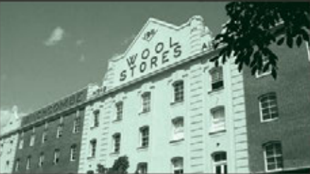
Winchcombe Carson Woolstores

Rivermakers is the latest project by BMI Group, the team of makers with the touch for benchmark urban renewal – redefining industrial and mixed-use developments across Brisbane.