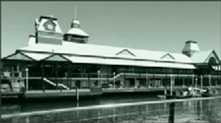
Breakfast Creek Wharf