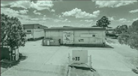
Murarrie Storage Park