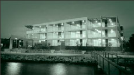
Oxford on Boardwalk